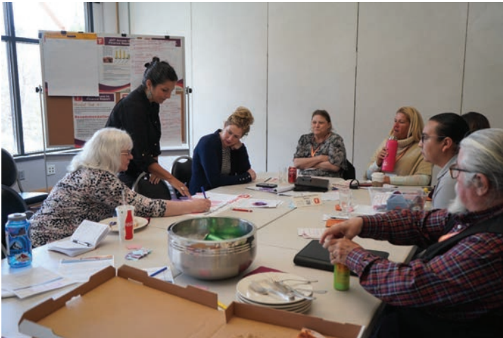
3F Access to Capital event. University of Montana.

Launched in the past year, the 3F Access to Capital event at the University of Montana brought together stakeholders from Indian Country, urban, and rural communities to address funding challenges for businesses. Held on April 17-18, 2024, the event provided scholarships and travel stipends to rural and indigenous partners. Key outcomes for Indian Country included identifying opportunities such as developing an AI tool for matching entrepreneurs with funding, training funders in cultural competencies, and creating a no-thesis investment fund to support rural and indigenous lenders.