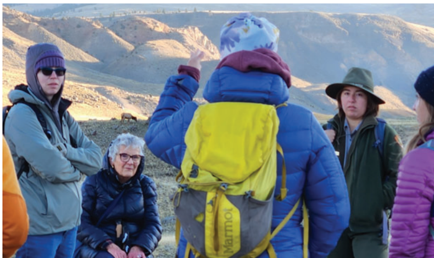
Elk River educators listen during one of the place-based learning tours. Montana State University Billings.

In the past year, the Elk River Writing Project, in partnership with Yellowstone Forever and supported by the National Writing Project and National Park Service grants, Montana State University Billings continued to engage educators in a meaningful place-based learning institute for teachers.