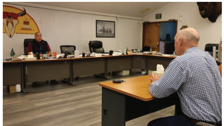
Gov. Gianforte visits with the Fort Belknap Indian Community Council. Governor's Office.