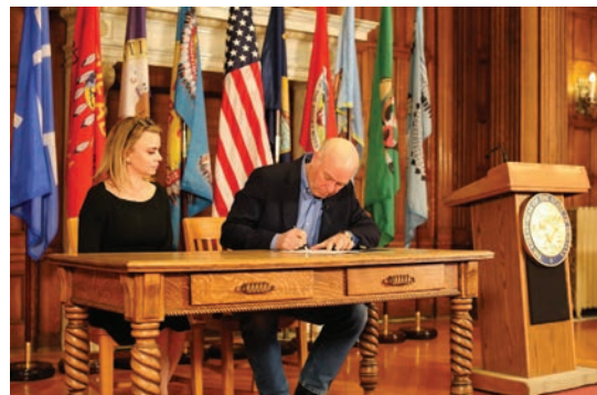
Gov. Gianforte signs a letter authorizing the investment of over $309 million to expand broadband access.

In the past year, the Montana Broadband Office (MBO) engaged with Tribal communities to improve broadband accessibility. Following the 2022 BEAD funding notice, MBO held Tribal stakeholder sessions in ten Montana cities, including a significant meeting on December 9th in Billings, coordinated by the Crow Tribe. Leaders from the Northern Cheyenne, Crow, and Fort Peck Tribes, along with Siyeh Communications, participated. These sessions aimed to ensure Montana's Tribal communities can access broadband funding to enhance connectivity statewide.