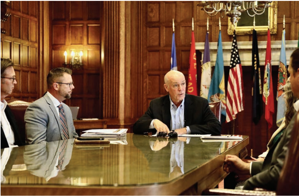
Gov. Gianforte receives third Housing Task Force report.

Spearheading state efforts to resolve the housing supply shortage, Gov. Gianforte launched a diverse, bipartisan Housing Task Force in July 2022.