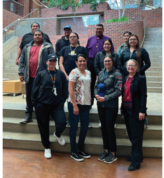
Members of MSUB staff visit Little Big Horn College. Montana State University Billings.

Flathead Valley Community College and Salish Kootenai College also have two transfer articulation agreements in place: Early Childhood Education and Elementary Education. Eight Flathead Valley Community College students have transferred to Salish Kootenai College with the intent to study in one of these two programs.