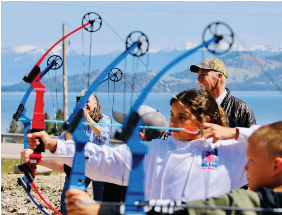
Gov. Gianforte joining Dayton Elementary students at the new public archery range at Flathead Lake State Park in Big Arm.

In 2024, the governor joined Montana Fish, Wildlife, and Parks (FWP) to celebrate the opening of a new public archery range at Flathead Lake State Park, located on the Flathead Reservation in Big Arm.