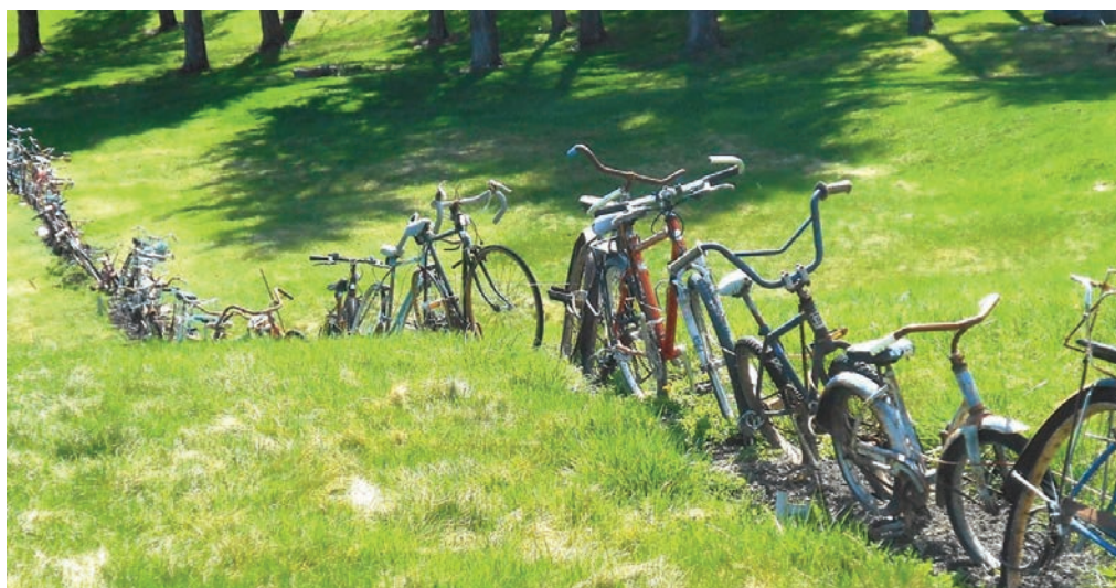
An art display created by a participant in a Creative Aging class in Browning.

Supported by grants and professional guidance from Lifetime Arts, MAC and MSL have launched programs in five Montana community libraries as models for future statewide efforts.