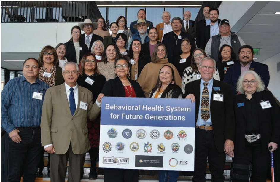
BHSFG Commission meeting with Tribal and Urban Indian Health Organization members in Great Falls on March 5, 2024.

The Commission and the Department of Public Health and Human Services (DPHHS) gained valuable insights from meetings with Tribal leaders and Urban Indian Health Organizations (UIHOs) about the behavioral health and developmental disabilities needs of Native American communities.