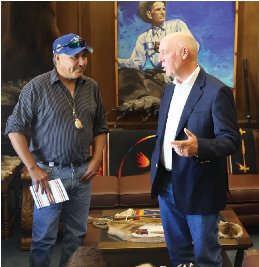
Gov. Gianforte speaks with a member of Blackfoot Nation during a tribal summit at the State Capitol in Helena.

At the summits, the leaders strategize on driving economic development, addressing substance use and addiction, promoting health and wellness, and building safer, stronger communities.