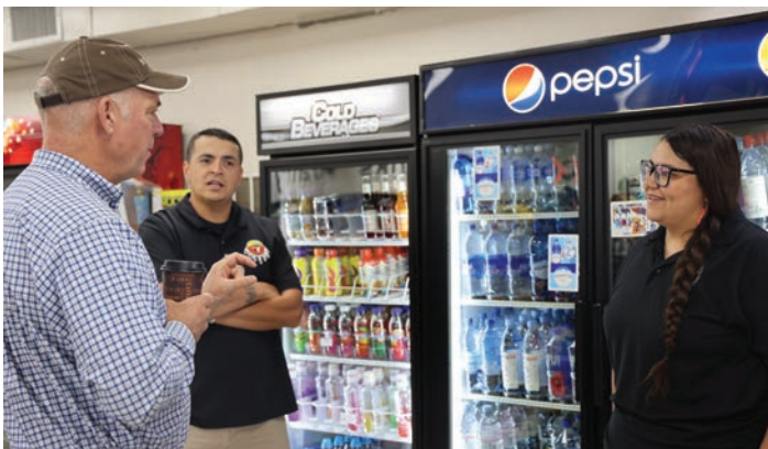
Gov. Gianforte talks with Little River Trading Post employees.

Every year, Governor Gianforte travels to each Indian reservation and headquarters, meeting with tribal leaders, small business owners, and community groups strengthening Indian Country.