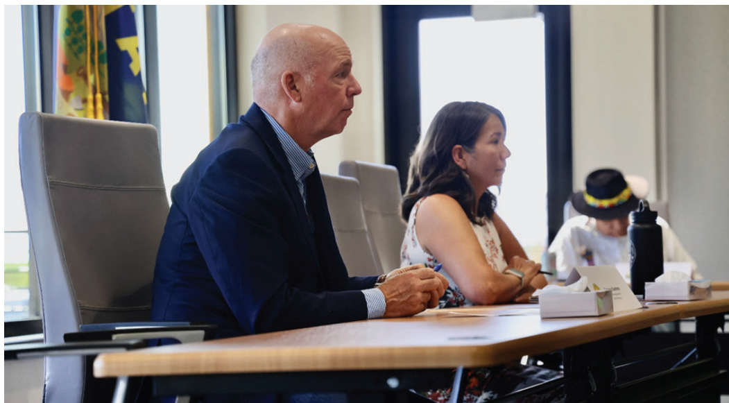
Gov. Gianforte hearing from the Rocky Boy Agency Tribal Council at the Rocky Boy Health Center in Box Elder.

The HEART Fund was the single largest new expenditure of the governor's first budget. In addition to supporting nonprofits and non-governmental organizations that serve Montana's urban, rural, and tribal communities, the HEART Fund provides a total of $500,000 in grants directly to Tribal Nations each year for substance use disorder prevention and mental health promotion.