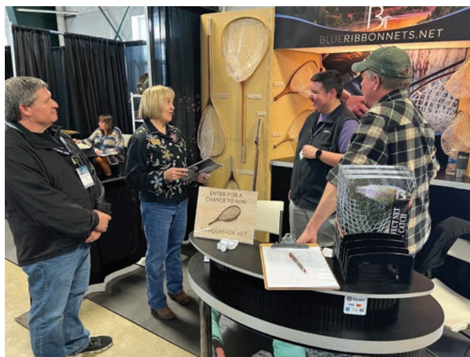
Lieutenant Governor Kristen Juras visits the Made in Montana Tradeshow with Little Shell Chippewa Tribe. Montana Department of Commerce.

The 2024 Made in Montana Tradeshow's Native American Made in Montana Pavilion featured four members; three were new program recruits, and all four were first-time exhibitors at the event. The primary function of the Tradeshow is to connect members with wholesale buyers. Each featured exhibitor received event support from Commerce's tribal tourism funds to offset their participation costs.