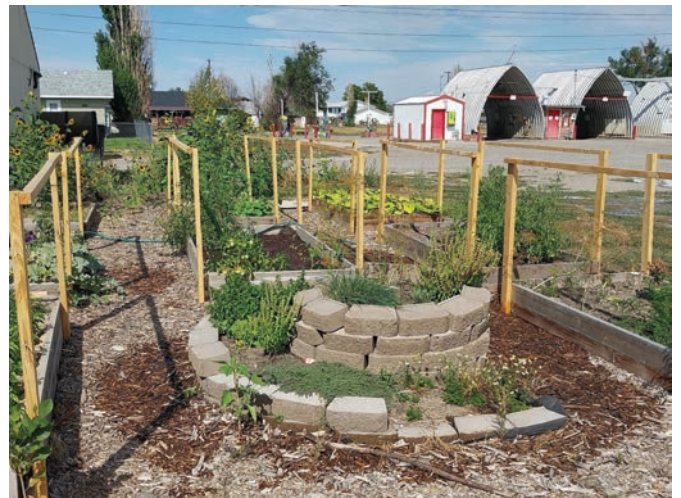
The Community Garden at Helping Hands Food Bank in Hardin.

People's Partner for Community Development: Northern Cheyenne Food Pantry Partners $134,000.