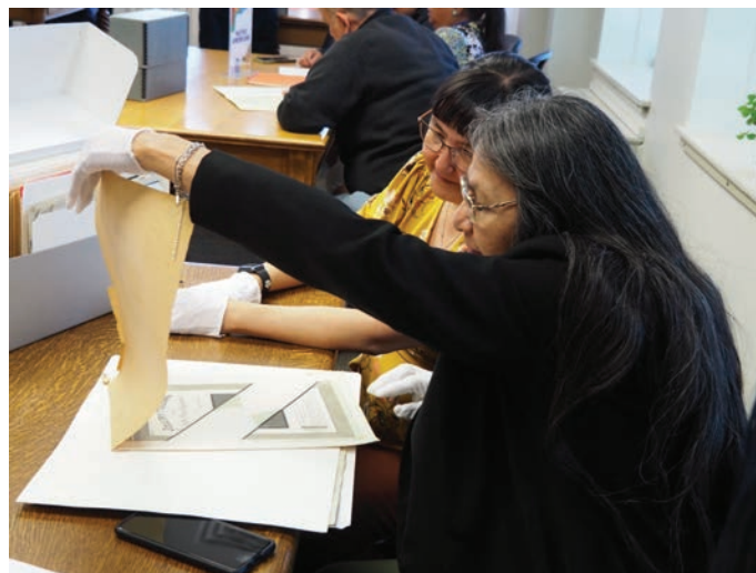
Tribal college librarians learning about archiving. Montana State University Library.

Funded by the MSU Library, TRAILS ensures that tribal college libraries serve both educational and community needs, enhancing access to digital resources, professional development, and support services, thereby fostering educational success across Montana's tribal communities.